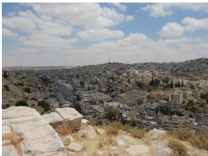
View over Amman from the Citadel

Amman is built on seven hills. As well as the bustling markets it's full of ancient historic attractions including the Citadel, Roman amphitheatre and Temple of Hercules.