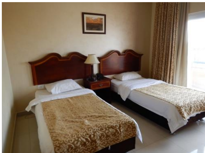
A typical bedroom at the Mosaic City Hotel

This comfortable 3 star hotel in the centre of Madaba is about 30 minutes from Amman airport.