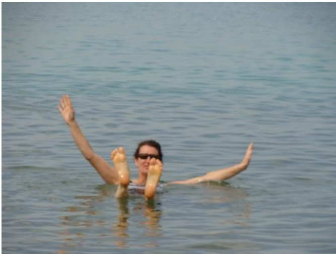
Floating in the Dead Sea

The Dead Sea lies in the Jordan Rift Valley. It is the lowest body of water on the planet and its salinity is about 10 times that of the oceans.