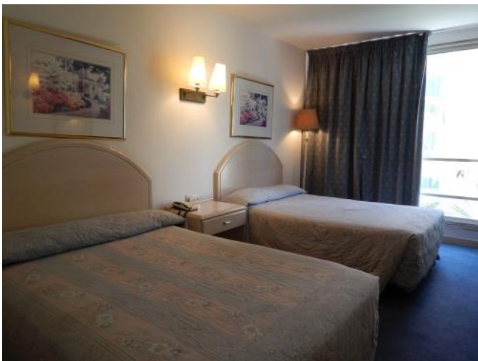
A typical bedroom at the Petra Palace Hotel

Overnight Petra Palace Hotel. This is a three star hotel near the Petra Visitor Centre.